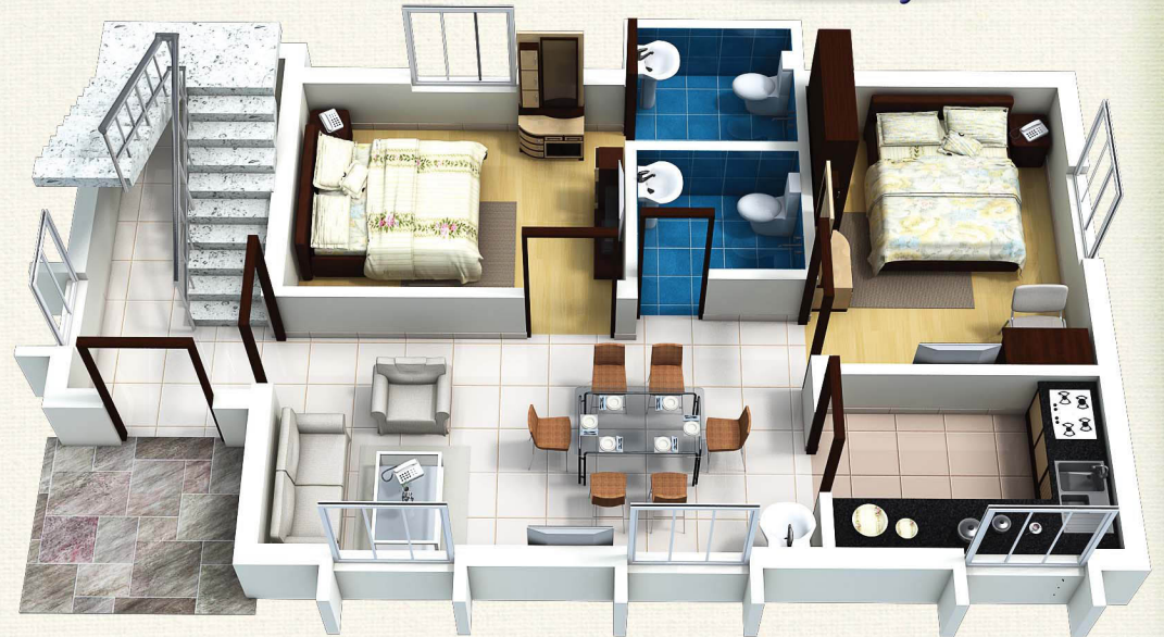
3D VIEW OF GROUND FLOOR